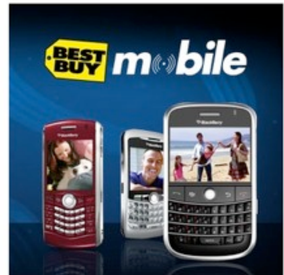
Mobile business also is set to grow.